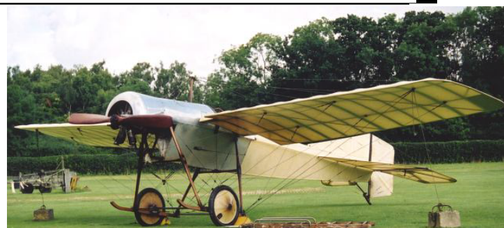
Shuttleworth's 1912 Blackburn Monoplane. Earliest British aircraft still in flying condition. No reason for including it here, other than that it is my favourite aeroplane and a mighty pretty picture.

after they have gone, do the decent thing, lock it up then moan at the next club night.